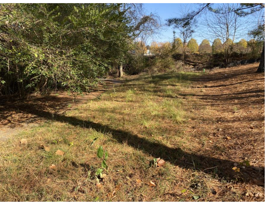
Photograph 12: Upstream end of buffer and greenway at northeastern parcel, facing northeast. Note: this parcel is not part of the buffer variance request.