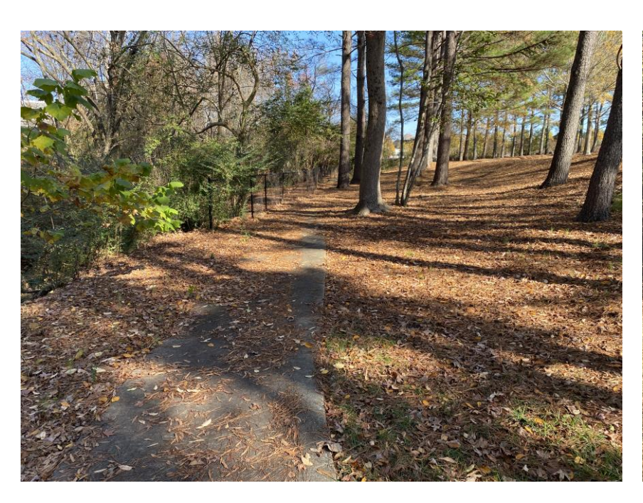
Photograph 11: Buffer and greenway at east central parcel where greenway is temporarily closed for public safety, facing northeast.