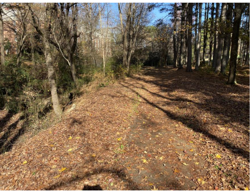
Photograph 6: Buffer and greenway just south of an existing pedestrian footbridge, facing northeast.