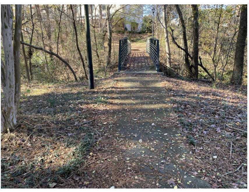
Photograph 8: Existing pedestrian bridge crossing Johns Creek, facing west.