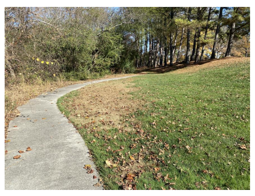
Photograph 10: Buffer and greenway north of existing pedestrian access to parking lot on the east, facing northeast.