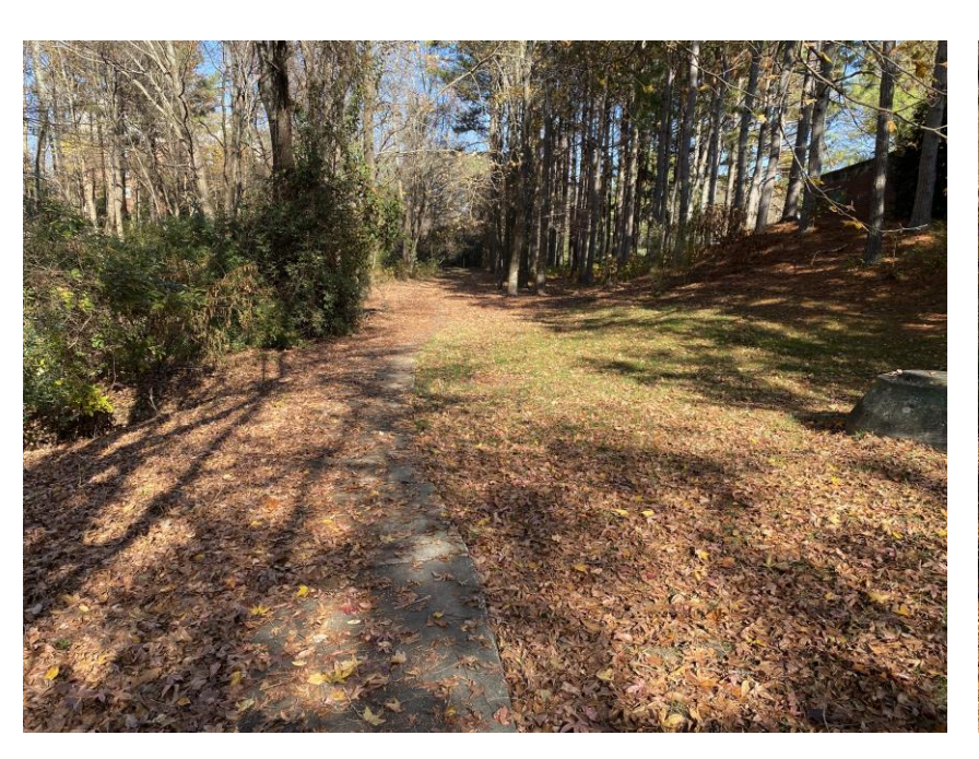
Photograph 5: Buffer and greenway at the northwest corner of the southeastern-most parcel, facing northeast.