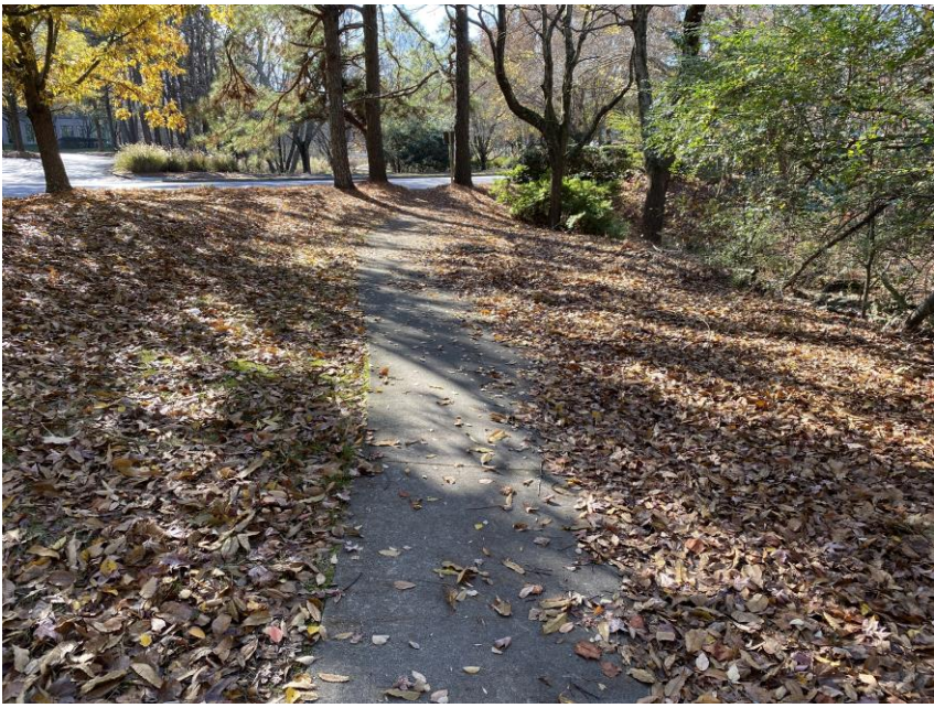
Photograph 1: Downstream end of buffer and greenway at East Johns Crossing, facing northeast.