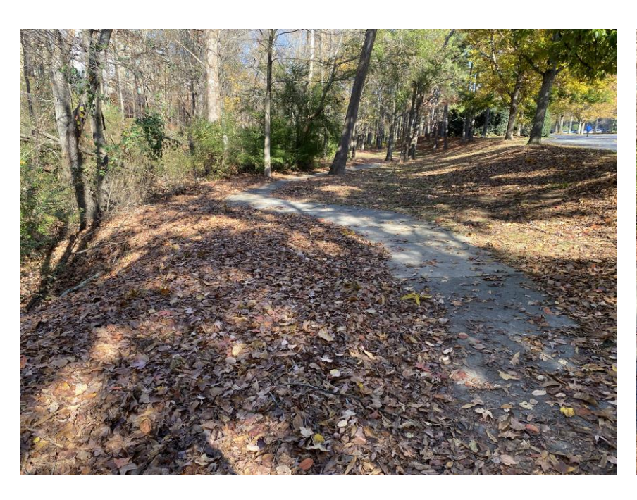
Photograph 3: Buffer and greenway at southeasternmost parcel, facing northeast.