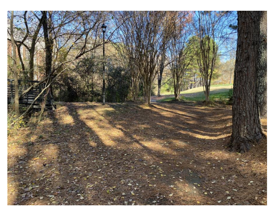
Photograph 7: Buffer at existing pedestrian footbridge, facing northeast.