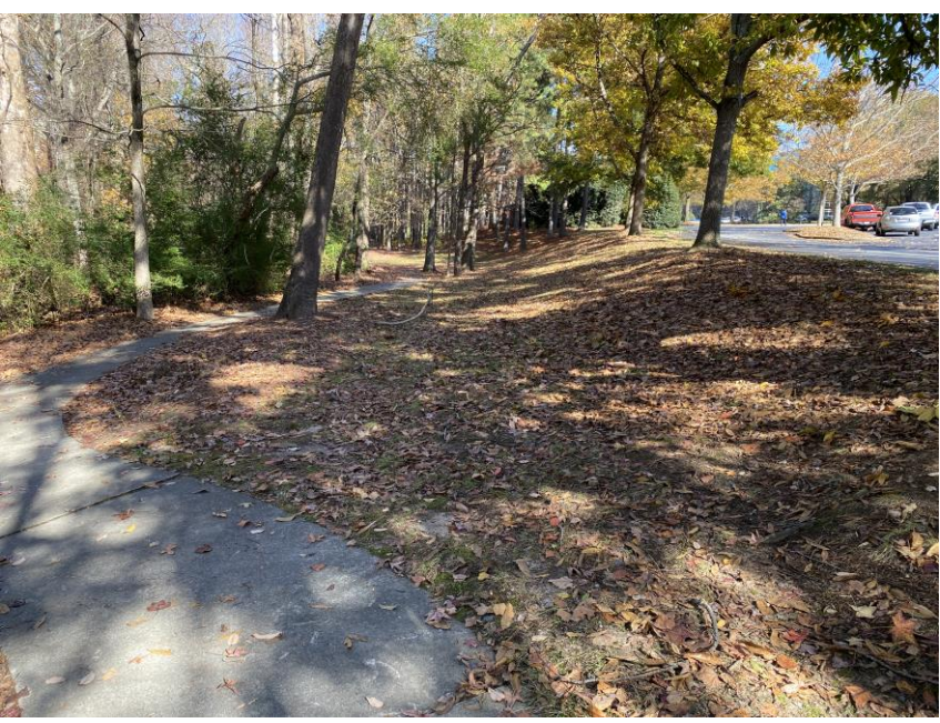
Photograph 4: Buffer and greenway at southeasternmost parcel, facing northeast.