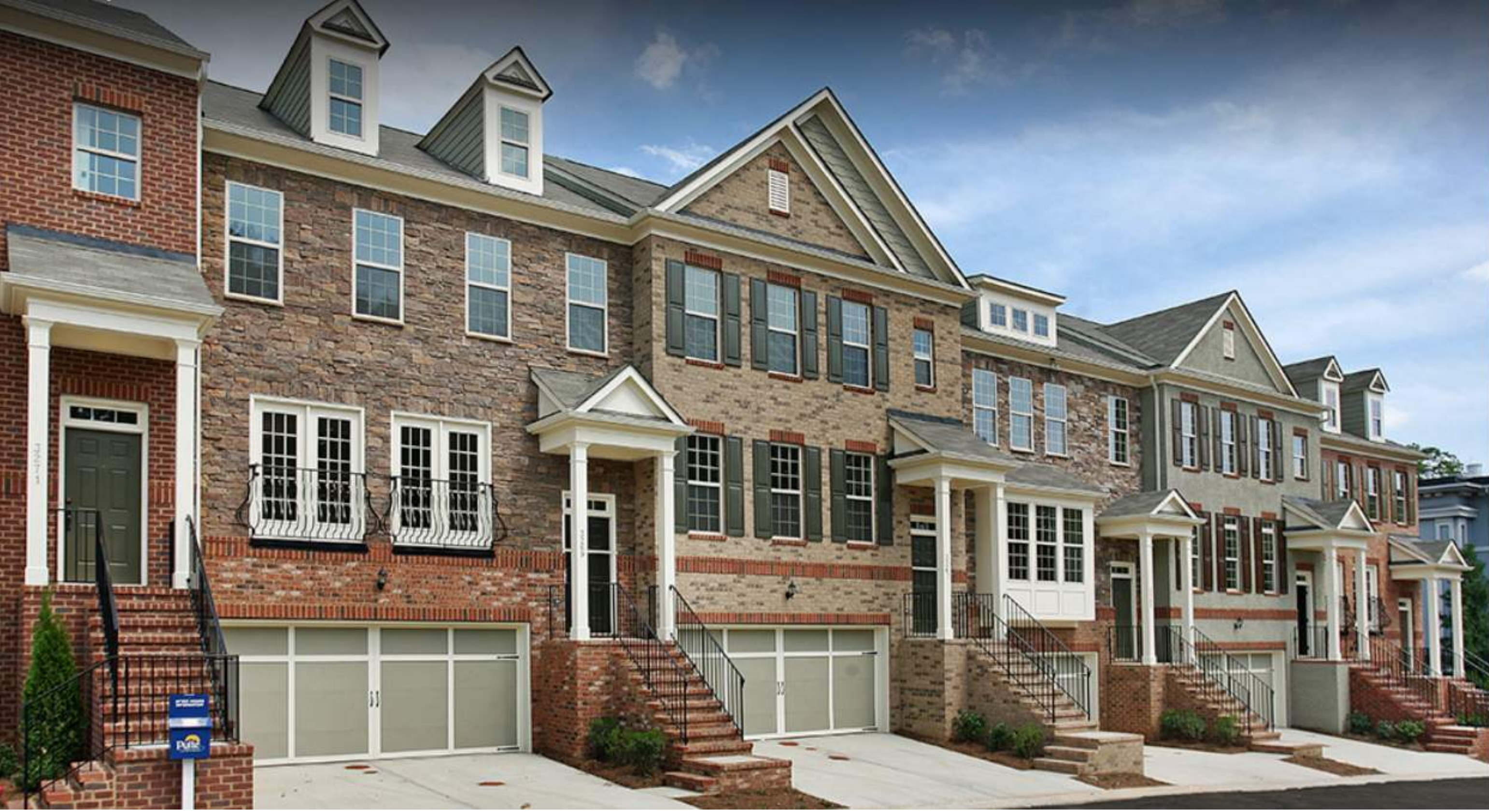
24' FRONT ENTRY

RECEIVED JAN 22 2019 City of Johns Creek Planning & Zoning RZ-19-002