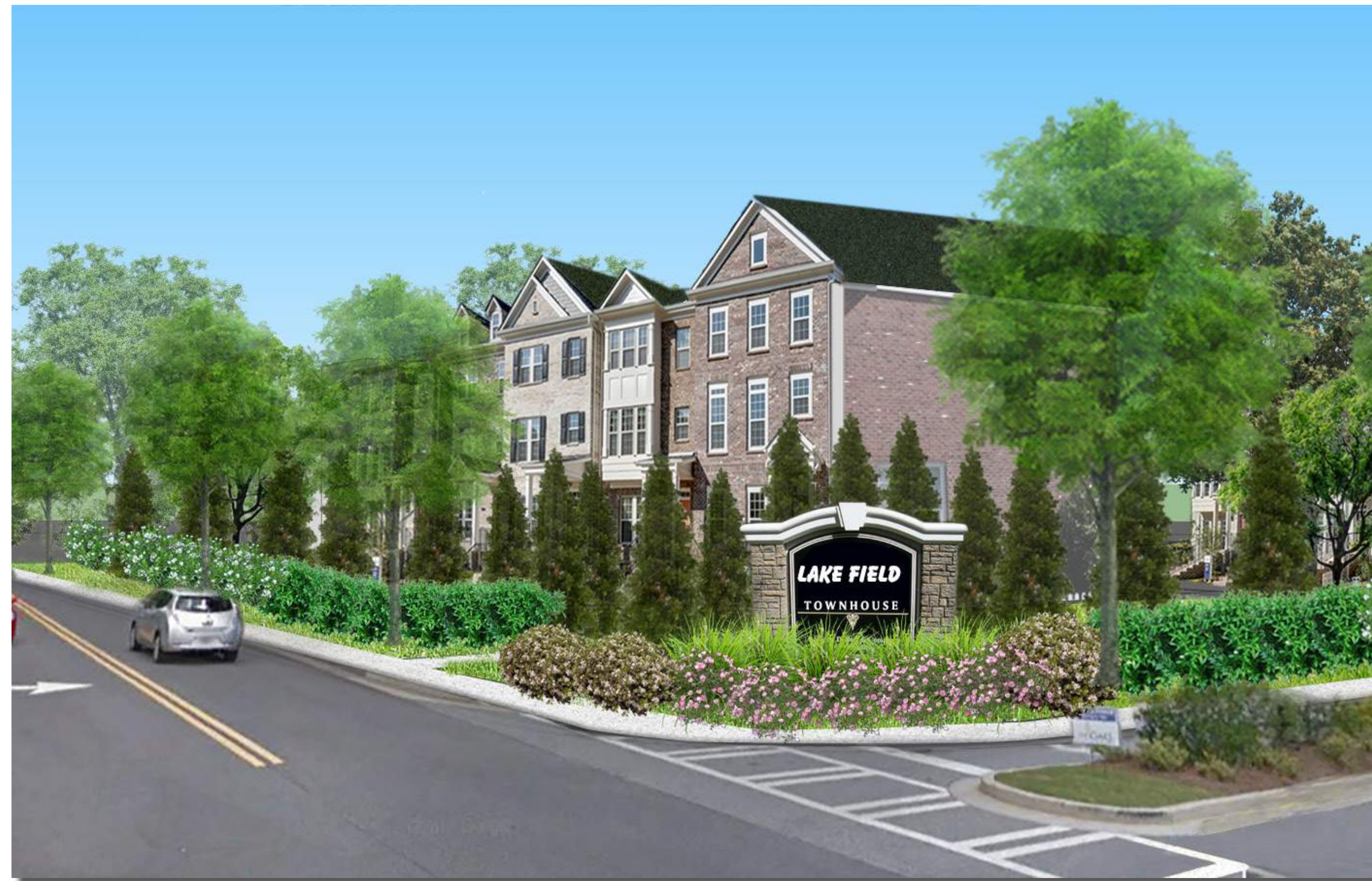
PERSPECTIVE ALONG TECHNOLOGY CIRCLE