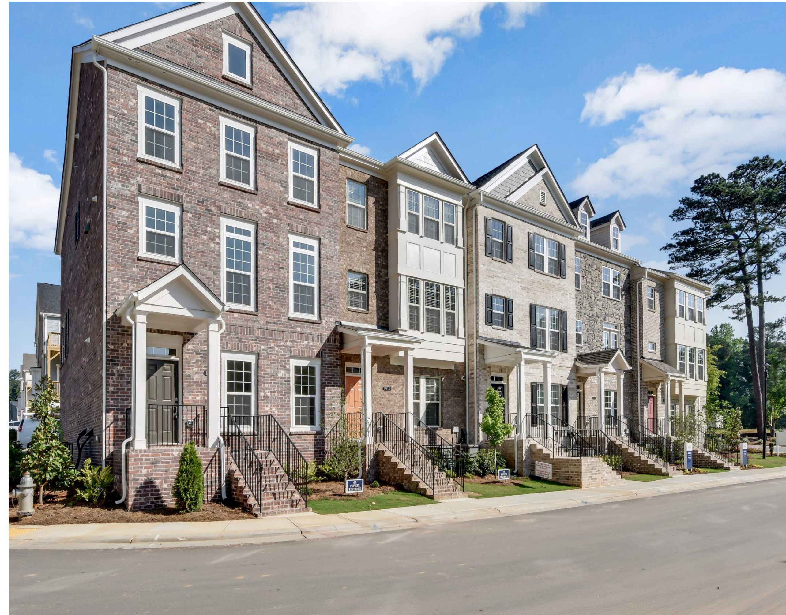
20' REAR LOAD