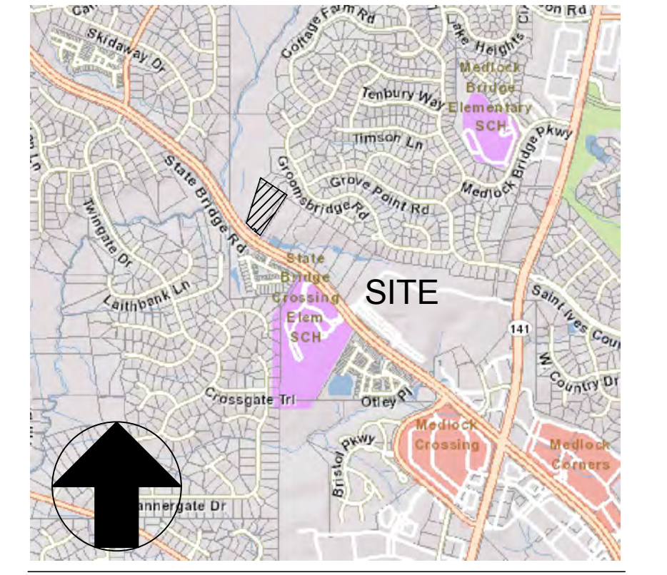
VICINITY MAP not to scale 5555 STATE BRIDGE ROAD JOHNS CREEK, GA. 30022