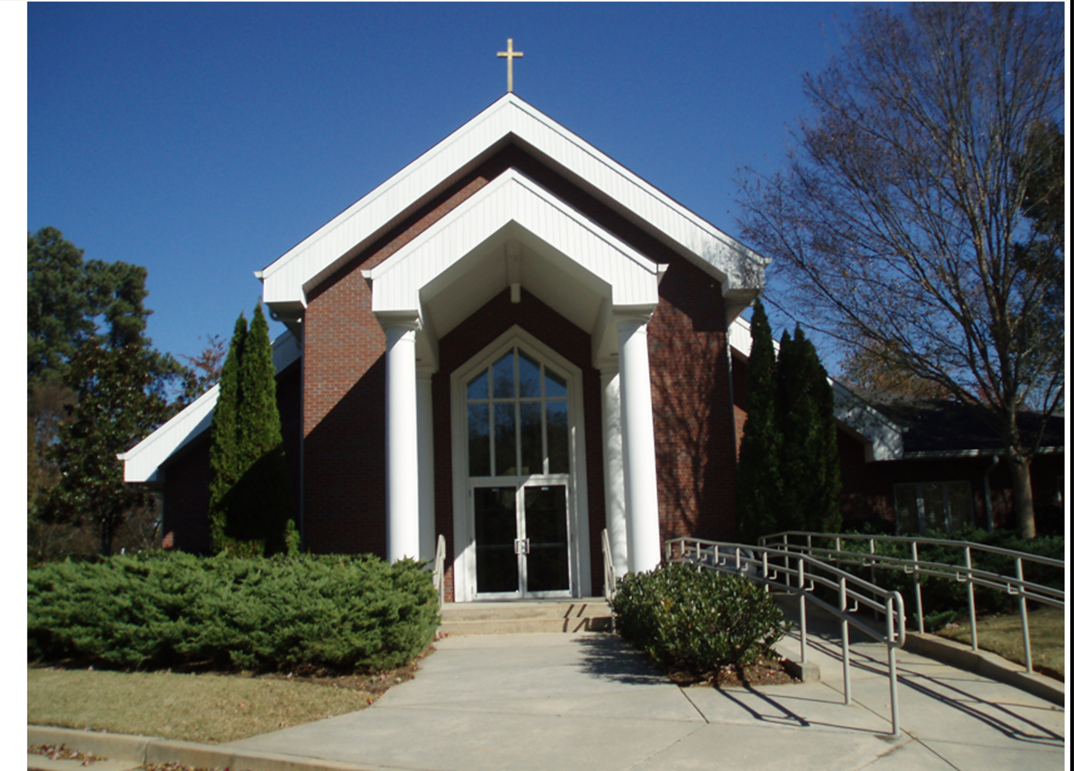
EXISTING MAIN CHURCH ENTRY FROM WEST PARKING LOT