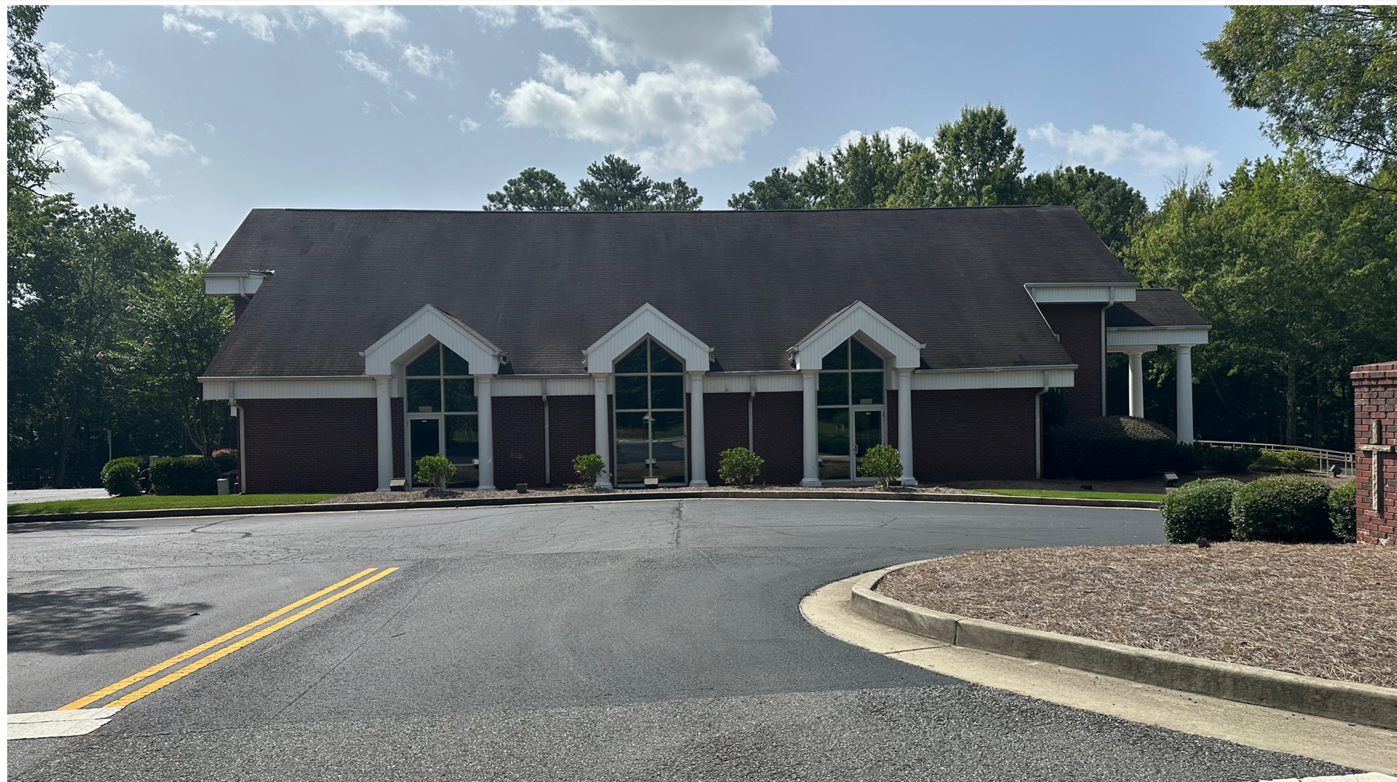
EXISTING STREET SIDE ELEVATION FROM KIMBALL BRIDGE RD

GEOMETRIC SHAPED STOREFRONT WINDOW & DOOR SYSTEMS