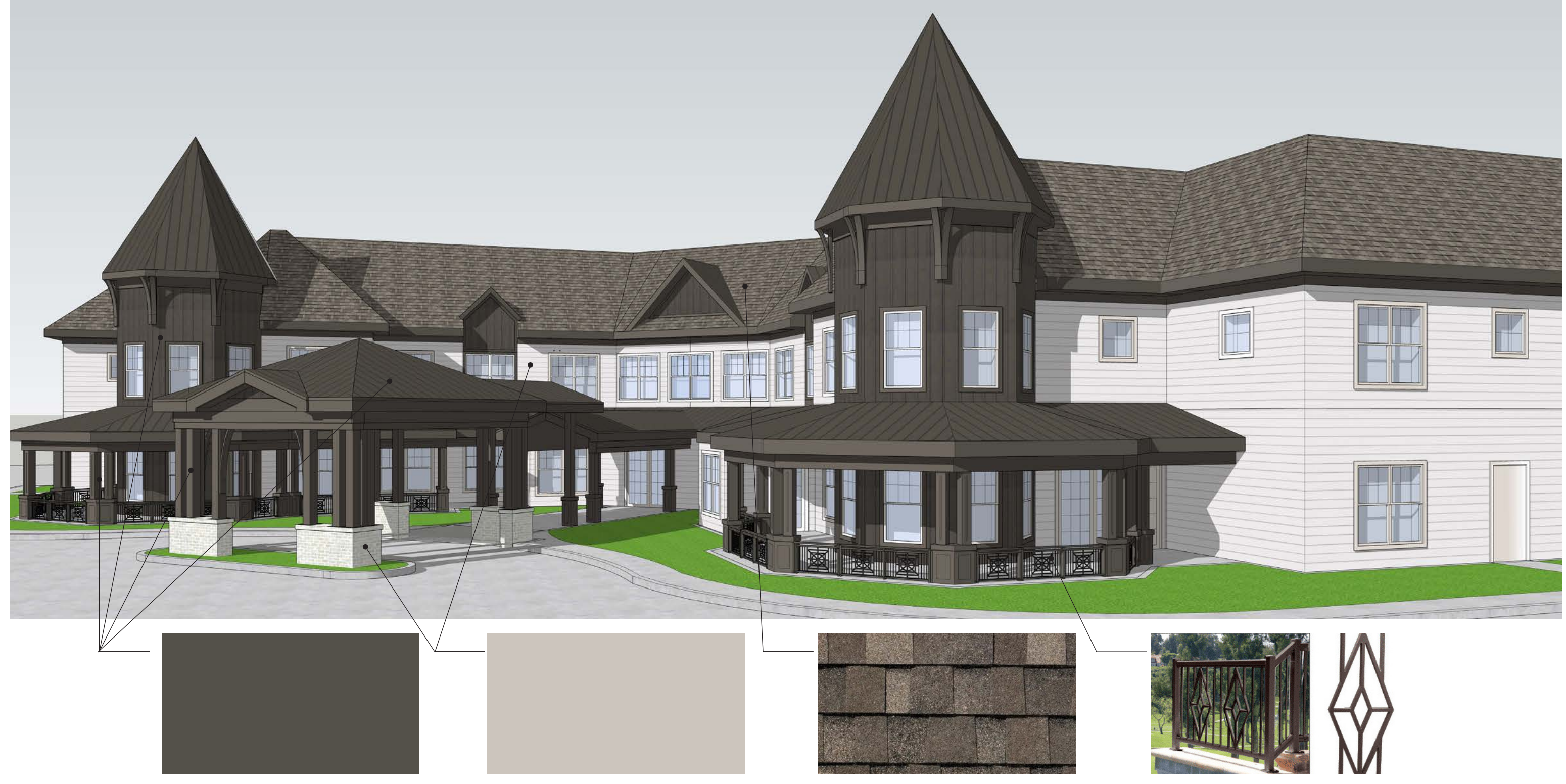
Urbane Bronze SW 7048 Cementitious Panels/Trim/Gutter/ Railing/Standing Seam Roof